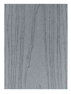
SILVER ASH Wood Grain Finish