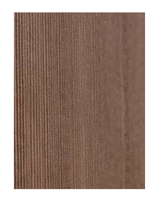
CEDAR WOOD Heavy Brush Finish