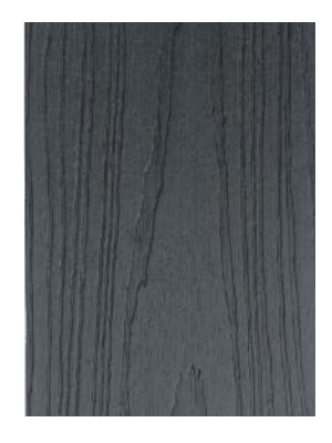
CAPE GREY Wood Grain Finish