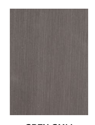
GREY GUM Heavy Brush Finish